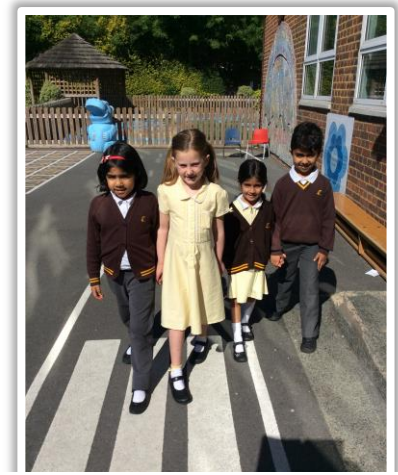
We are enjoying walking to school every Wednesday

The children have been trying hard to walk to school every Wednesday. If they walk to school every Wednesday for the month they get a badge. A couple of weeks ago was 'walk to school week' where the children were encouraged to walk every day. We have talked to them about the benefits of this and the safety aspects. Also, we are asking pupils in Harrow to design a walking mascot! Pupils can draw a picture of a mascot that will help us promote walking to school. The winning design will be transformed into a real life mascot, which will be used in schools throughout the borough. What an exciting opportunity!