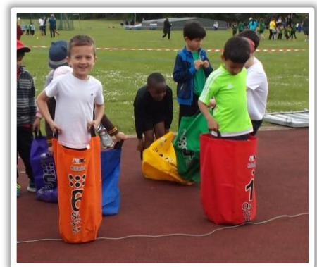
Fun at the mini Olympics