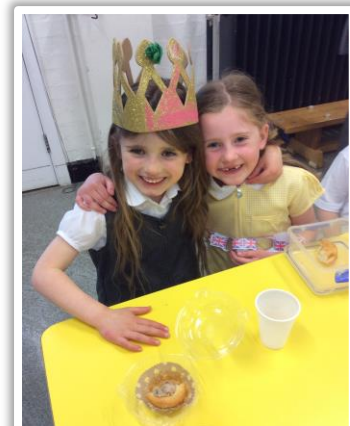
Celebrating Queen Elizabeth's birthday

Children in Year 2 have developed their musical skills throughout the year through participating in the Harrow Strings project. They have enjoyed learning to play the violin, viola and cello and now can play a range of different songs. We would love to share this with parents and carers on Thursday 7th July at 10.15 in the downstairs hall.