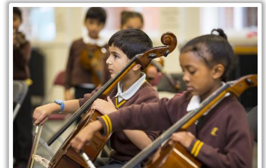
Year 2 children playing the cello