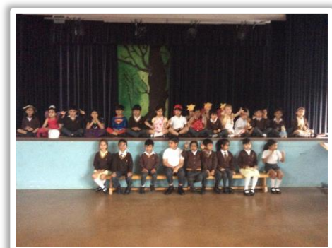
Well done to 1S and 1A for their recent amazing assemblies!