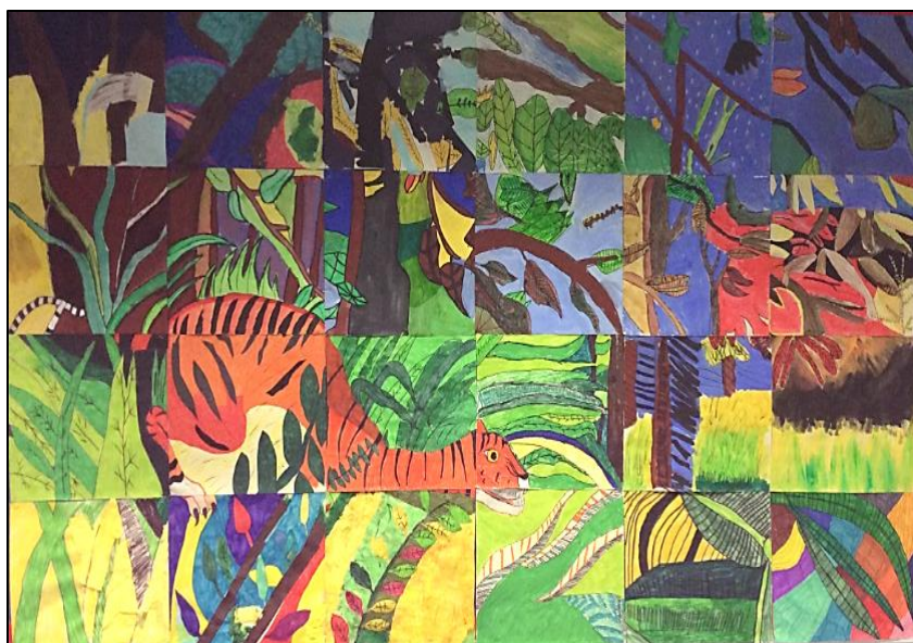
Display of Year 6 children's interpretations of Henri Rousseau's painting the Surprise.

"We have really enjoyed Art Day in Year 6. We researched the life of Henri Rousseau and created our A4 versions of his painting titled: the Surprise. We used different mediums such as: paints, felt tips, charcoal and tissue to create our masterpieces!" Year 6 pupils